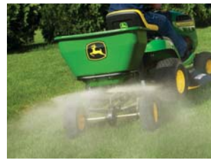
175-lb. Tow-Behind Spreader