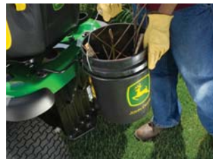
Cargo Bucket Holder